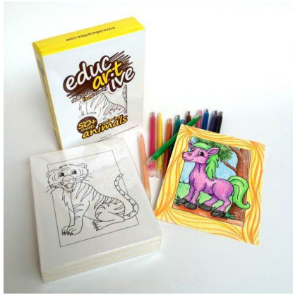
Coloring Competition by Educative Sept 8 th