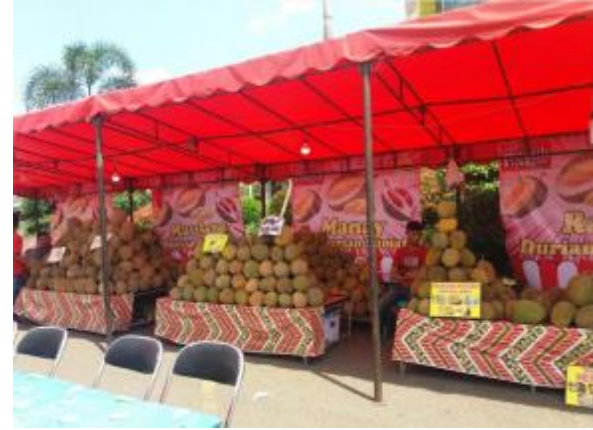
Food Festival Sept 21,22,23 Oct 18,19,20