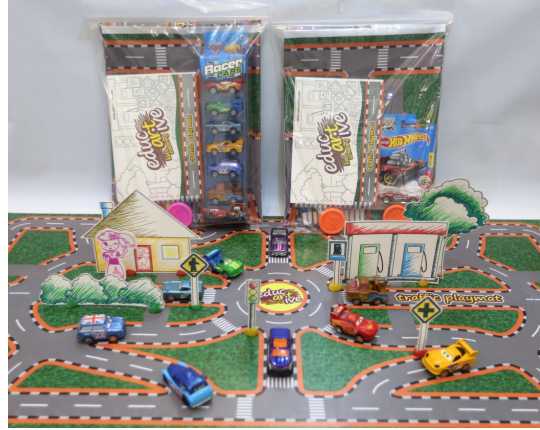
Traffic Playmate by Educative October 6 th