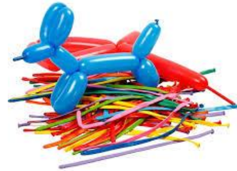
Balloon Animal Making